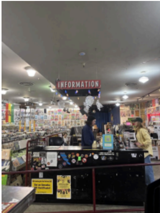
Information booth

Amoeba's decision to front-load non-music merchandise exposes a tension between its self-image as a cultural institution and its need to survive as a business. The first things we see as we walk past the entrance hallway are clothes, books, magazines, merchandise, everything except records, CDs, and DVDs. If Amoeba is a record store, why place all its non-music items at the front? Part of this choice feels pragmatic, an acknowledgment that physical music formats (especially CDs) are no longer used by everyone. At the same time, this layout functions as a more inclusive design strategy. By placing shirts, books, and other accessible items at the entrance, the store offers something for anyone passing through, so even a casual visitor can leave with a tangible souvenir.