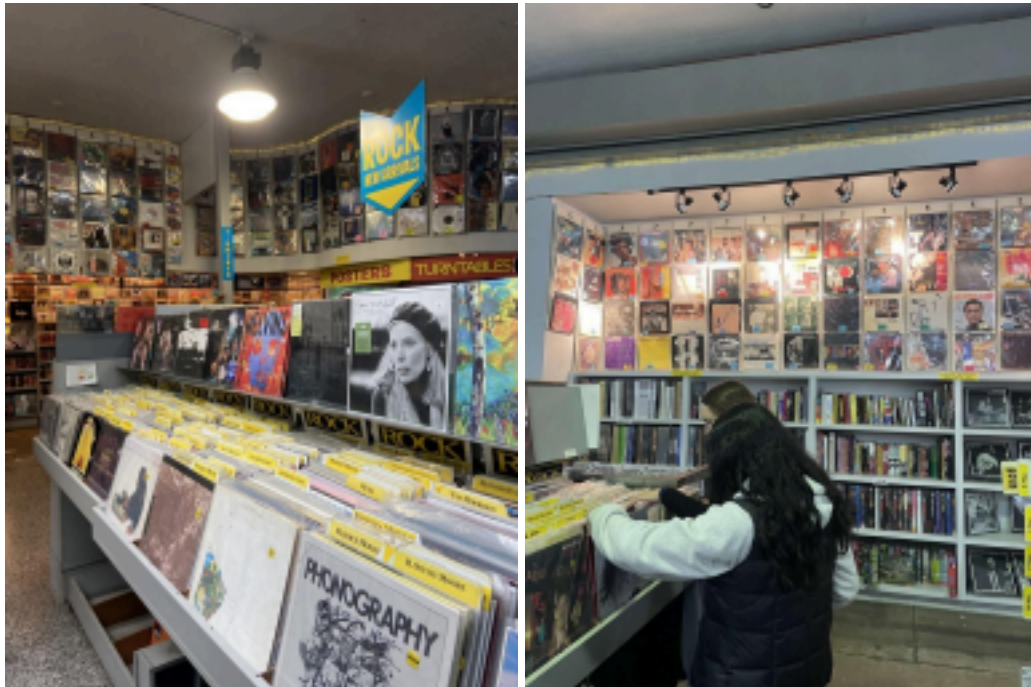
Berkeley

Across its three locations, Amoeba performs three distinct identities shaped by each city's history, audience, and cultural economy. The original Berkeley store, opened in 1990 on Telegraph Avenue, feels the least theatrical. It's smaller and more understated, with a larger used section and a distinctly "local record store" energy. It primarily serves regulars (especially UC Berkeley students) and carries the deepest lineage, emerging directly from the Rasputin Records tradition. 8 If the San Francisco location connects itself to the 1960s Haight mythology, Berkeley connects to its own history and the local intellectual culture.