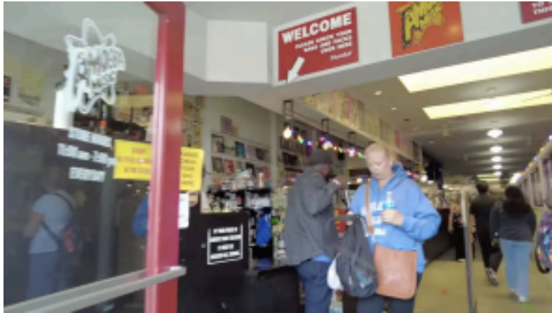
Bag Check, courtesy of Caliwalks on Youtube

The bag check at Amoeba is both practical and symbolic. The store carries small, high-value items like vinyl and box sets displayed in dense rows with limited sightlines, making the space vulnerable to theft. But beyond theft prevention, the bag check subtly elevates the space.